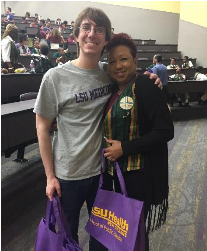
The children chose books from the LSUHSC campus-wide book drive and teachers received LSUHSC gifts.